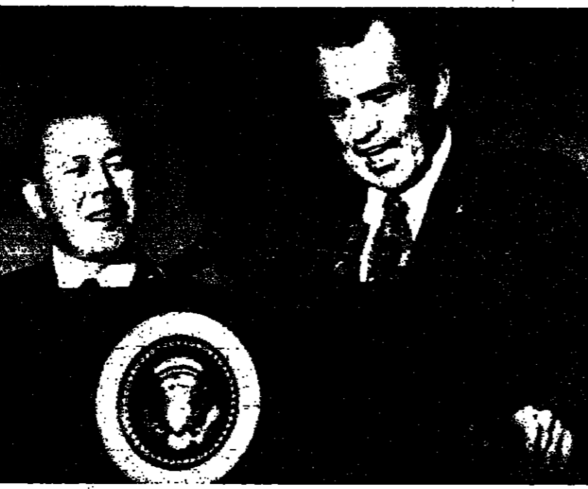
President Nixon gets smile from Japanese Premier Tanaka as he extends welcome to him at Hickam Air Force Base in Hawaii on his arrival for summit talks.

The trade was the main topic of the summit. Mr. Nixon warned in advance of two days of meetings with Mr. Tanaka that failure to improve the situation would cause a clamour on the part of American protectionists to impose quotas and restrictions upon Japanese exports. Trade concessions were expected to be outlined in a joint statement issued at the conclusion of the summit talks on Friday.